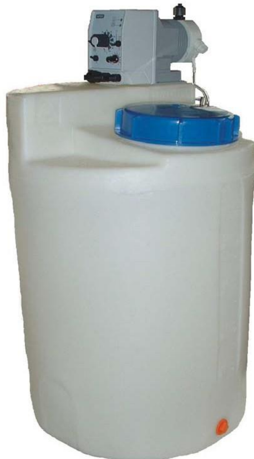
Dosing station DP